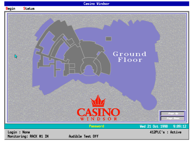
Click on a floor to zoom for greater detail